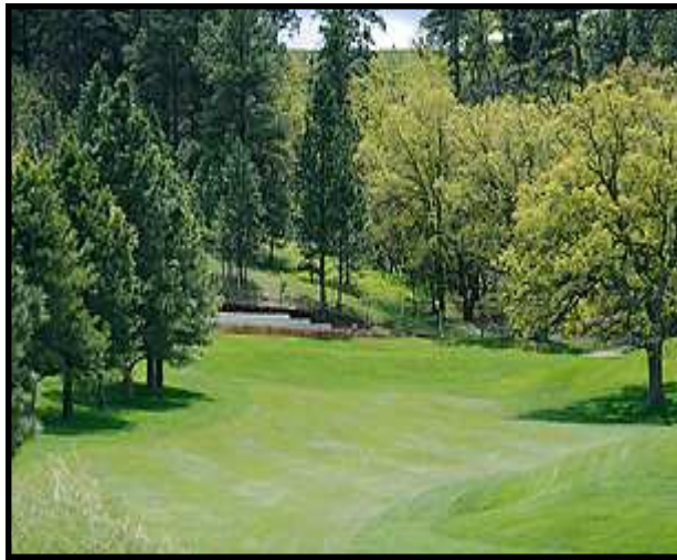
A picturesque look up hole 5 fairway.

Please pay special attention to our website and newsletters as we are planning some new member events for 2009. We will post event information as soon as the schedule is completed.